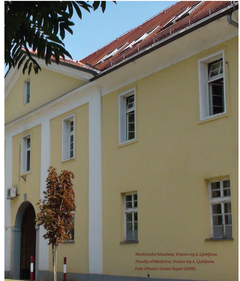
Medicinska fakulteta, Vrazov trg 2, Ljubljana. Faculty of Medicine, Vrazov trg 2, Ljubljana. Foto (Photo): Dušan Šuput (2009).